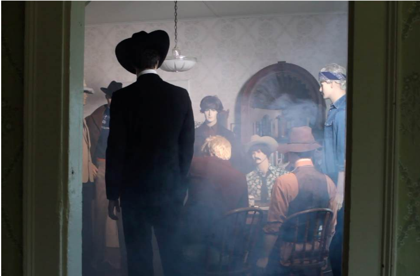
MARIANNA ROTHEN Mail Order , 2019/2025 Installation, mannequins, table, fog machine, playing cards Dimensions variable