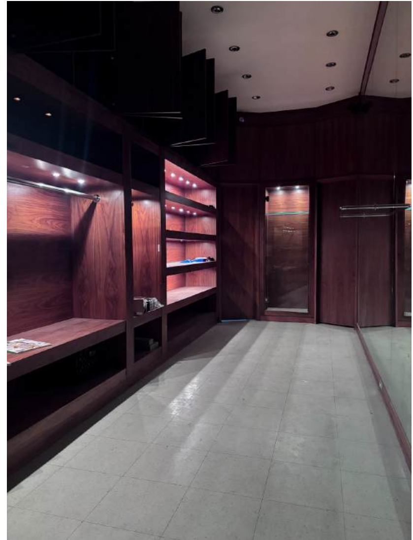
158 Rivington Street, NYC (Gallery as found unoccupied), 2025

In the ruins of a hype beast retailer, a mélange of mannequins, animism, and electromagnetic field interpretations become The Theatre.