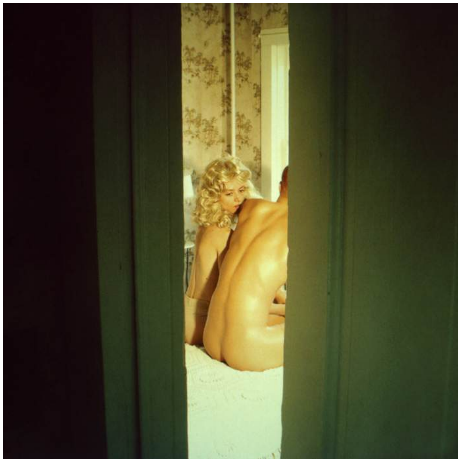
MARIANNA ROTHEN Ken , 2017 Archival Pigment Print