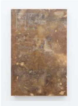
ANNA TING MOLLER Fun park, 2024 Kombucha on wood panel 11 x 7 in.