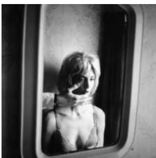
MARIANNA ROTHEN The Italian , 2017 Archival pigment print 17 x 17 in. A.P.