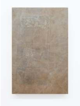
ANNA TING MOLLER Shed , 2024 Kombucha on wood panel 11 x 7 in.