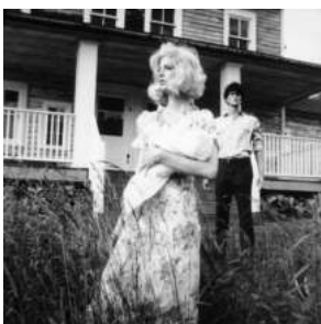
MARIANNA ROTHEN House on the Prairie , 2017 Archival pigment print 17 x 17 in. Edition of 4/5 + 1 A.P.