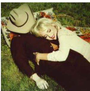
MARIANNA ROTHEN Close to You , 2017 Archival pigment print 25 x 25 in. Edition of 4/5 + 1 A.P.