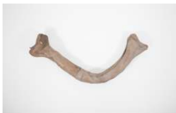
ANNA TING MÖLLER Untitled (Bone I), 2022 Ceramic and kombucha 5 x 15 x 5 in.