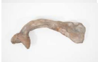
ANNA TING MOLLER Untitled (Bone II), 2022 Ceramic and kombucha 5 x 15 x 5 in.