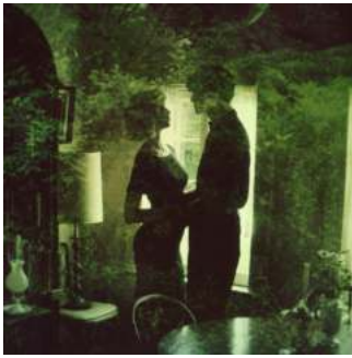
MARIANNA ROTHEN True Romance , 2017 Archival pigment print 17 x 17 in. Edition of 3/5 + 1 A.P.