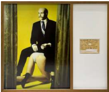
MARIANNA ROTHEN Glory Daze , 2020 Archival pigment print Diary entry 6 x 8 in. Photograph 20 x 15 in. Edition of 1/5 + 1 A.P. Framing: $723.00