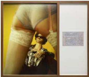
MARIANNA ROTHEN Valentine's Day , 2020 Archival pigment print Diary entry 6 x 8 in. Photograph 20 x 15 in. Edition of 1/5 + 1 A.P. Framing: $723.00