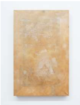
ANNA TING MOLLER Thousand and thousand search , 2024 Kombucha on wood panel 11 x 7 in