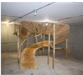
LUCA REKOSH Soup (So Up), 2025 Wood, muslin, rope, projection, sound Dimensions variable