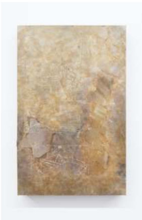
ANNA TING MOLLER Dragon inn , 2024 Kombucha on wood panel 11 x 7 in.