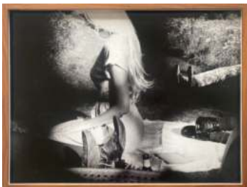
MARIANNA ROTHEN Nutcracker , 2017 Archival pigment print Photograph 15 x 20 in. Edition of 1/5 + 1 A.P. Framing: $500.00