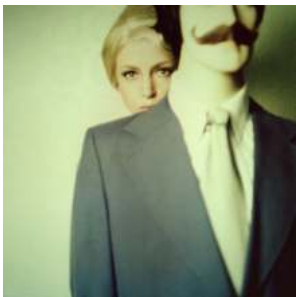
MARIANNA ROTHEN Stand by Your Man , 2017 Archival pigment print 25 x 25 in. Edition of 2/5 + 1 A.P.