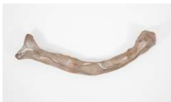
ANNA TING MOLLER Untitled (Bone III), 2022 Ceramic and kombucha 5 x 15 x 5 in.