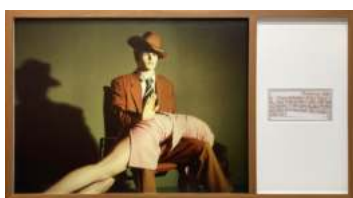
MARIANNA ROTHEN Back Rubs , 2020 Archival pigment print Diary entry 6 x 8 in. Photograph 15 x 20 in. Edition of 1/5 + 1 A.P. Framing: $723.00