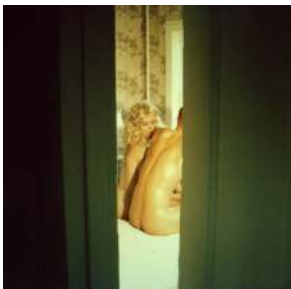
MARIANNA ROTHEN Ken , 2017 Archival pigment print 17 x 17 in. Edition of 3/5 + 1 A.P.