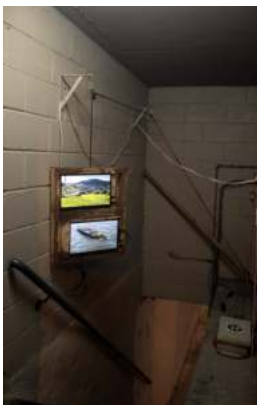
LUCA REKOSH Dede, 2025 Wood, digital displays, sound Dimensions variable