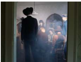
MARIANNA ROTHEN Cock-A-Doodle-Do , 2019 Installation, Male mannequins (fiberglass and plastic), wigs, moustaches, clothing, fabric, plastic food, aluminum cans, cigarettes, wood, table, chairs, picture frames, glass, photographs, tape Dimensions variable