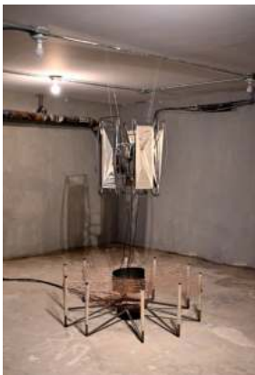
MILES SCHARFF Even if something did you would never really know, 2025 Copper, steel, conductive fabric, felt, variable electromagnetic receiver, magnets, amplifier, speaker Dimensions variable