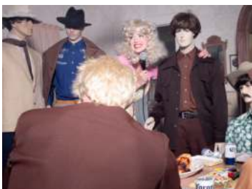
MARIANNA ROTHEN Mail Order , 2019 Single channel HD video Color, sound, 17:32 min. Edition of 1/4 + 1 A.P.