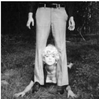
MARIANNA ROTHEN Lobster , 2017 Archival pigment print 25 x 25 in. Edition 2/5 + 1 A.P.