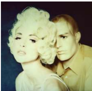
MARIANNA ROTHEN Babyface , 2017 Archival pigment print 25 x 25 in. Edition of 3/5 + 1 A.P.